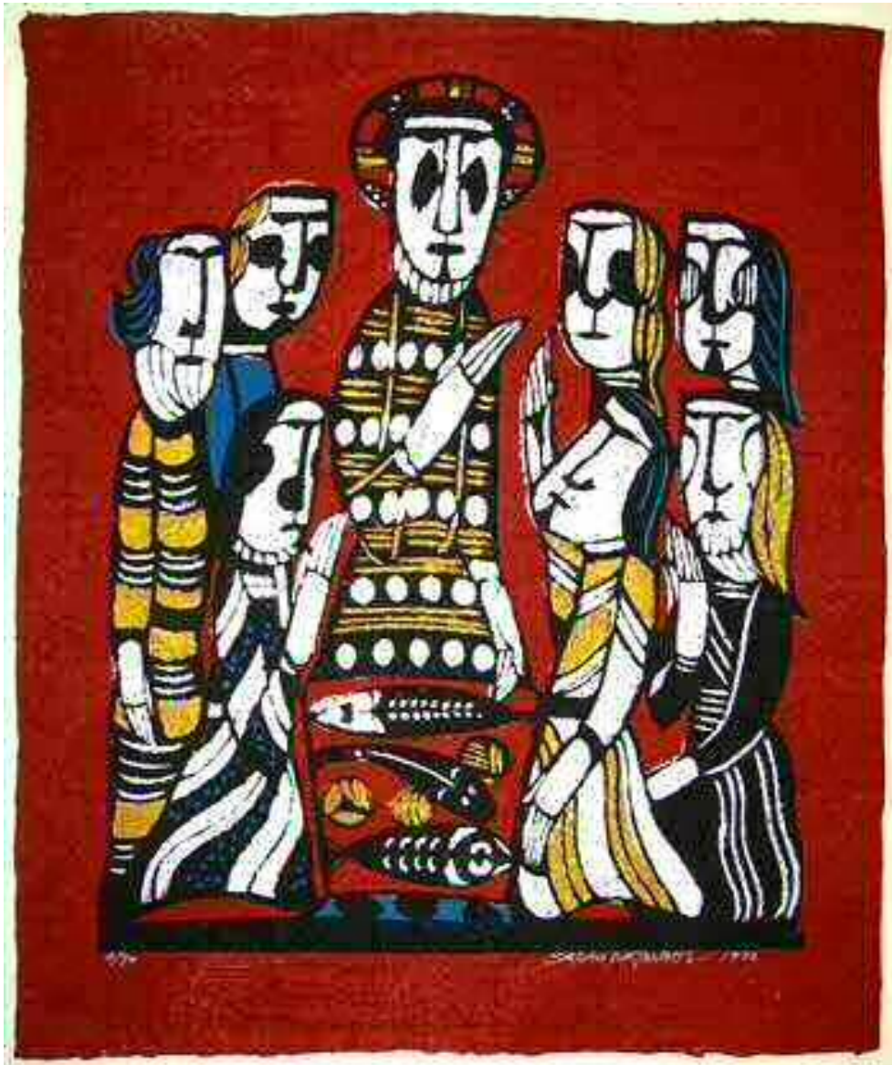
The Last Supper, by Sadao Watanabe (1913-1996)

A Processional song for the Gathering Rite