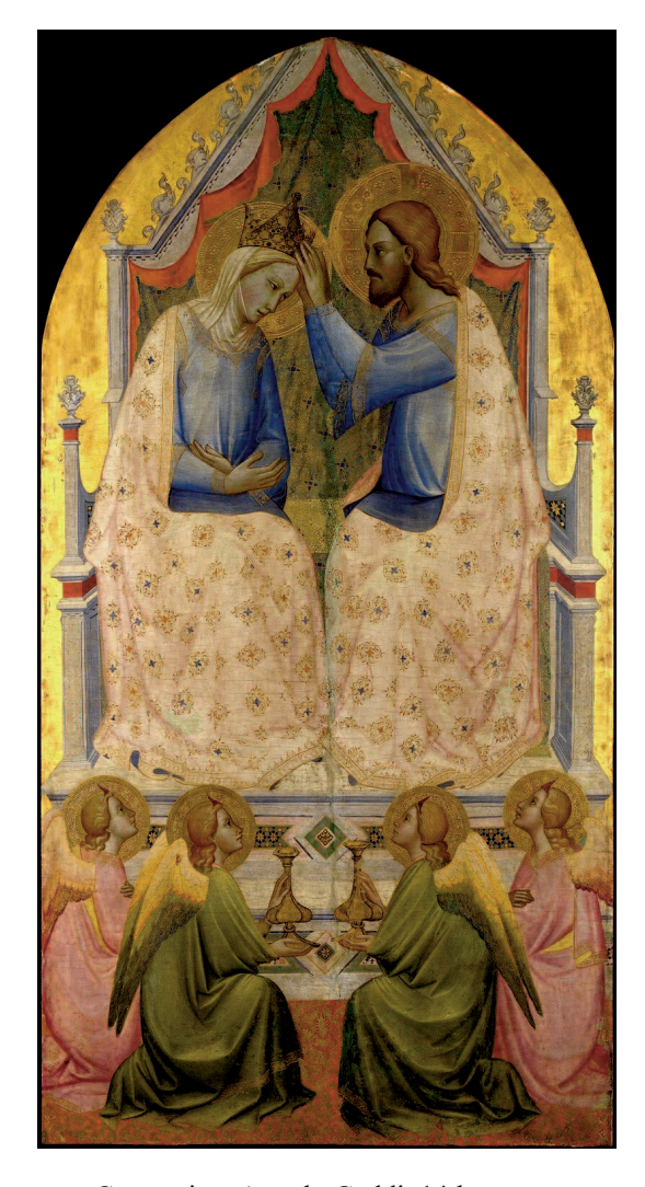
Coronation, Agnolo Gaddi, 14th century

Through the same Christ, our Lord. Amen.